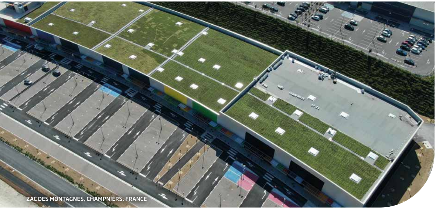
ZAC DES MONTAGNES, CHAMPNIERS, FRANCE